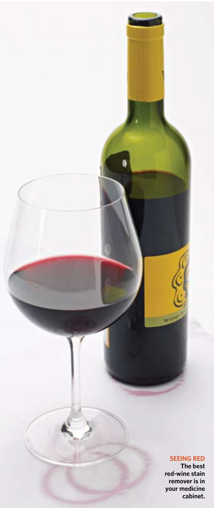
SEEING RED The best red-wine stain remover is in your medicine cabinet.